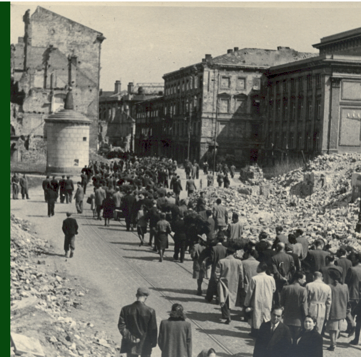
Commemorating the 4th anniversary of the Warsaw Ghetto Uprising

Tel: +48 22 525 83 00 Fax: + 48 22 525 83 37