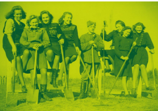
Voluntary work assignment on the school sports field, Klaipėda 1948/49